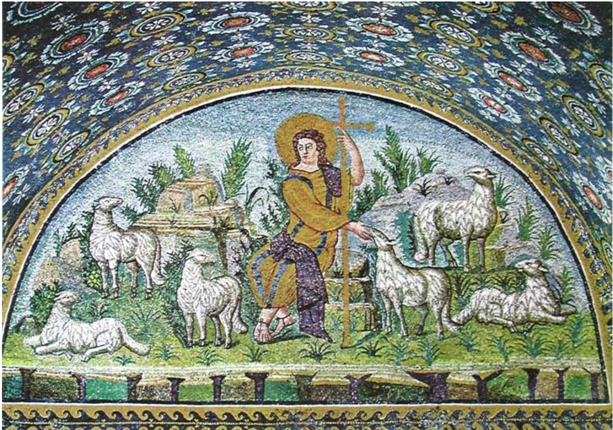
Mosaic of the Good Shepherd, Mausoleum of Galla Placidia, Ravenna, Italy